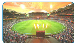
International Cricket Stadium