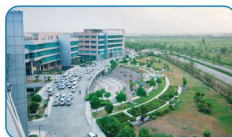
400 Acres Manufacture SEZ