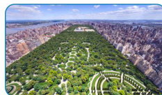
Newyork Central Park