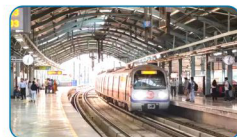
Proposed Metro Station