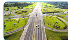
Very Near to Proposed RRR