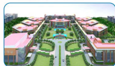
Skill University - 57 Acres