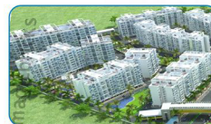
Mega Township - 1400 Acres