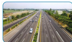
N-Sagar &amp; Srisailam 4- Lanes Highway