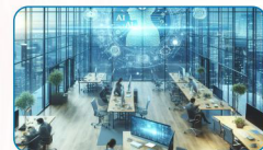
Al - City